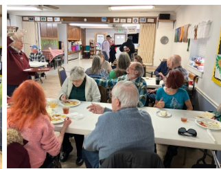
March 14 - Mountain Eire Dancers