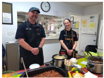
NE Teller Fire Dept Lunch servers